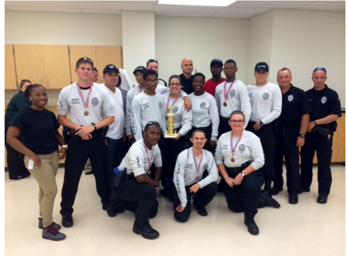
Sunrise Police Explorers

Trophy and Medal presentation at the Explorer Competition